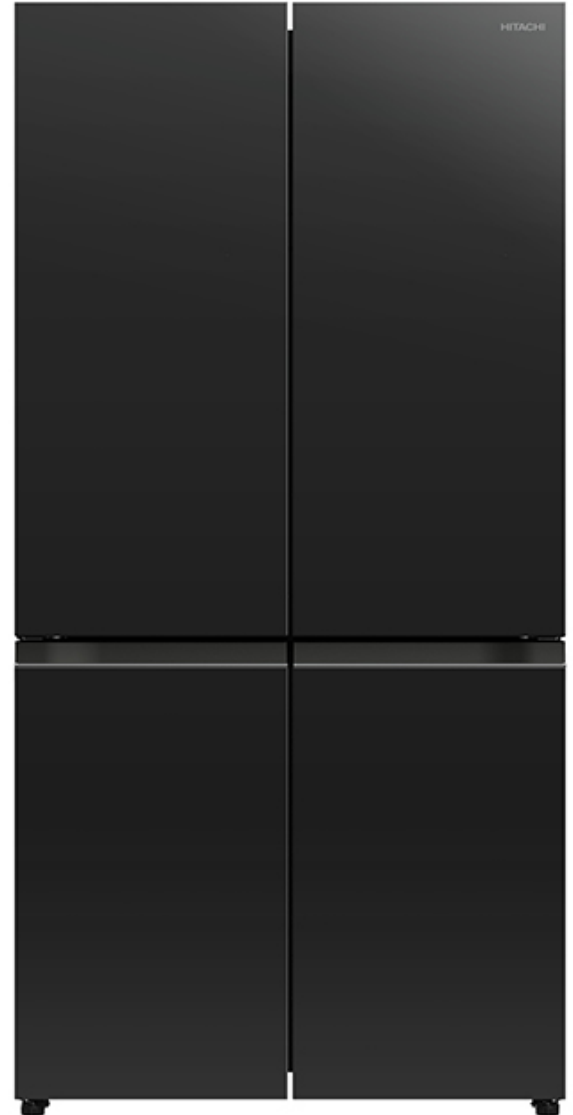
R-WB640PT1GCK Glass Clear Black

*This fridge are certified to AS/NZ IEC 62552-3.